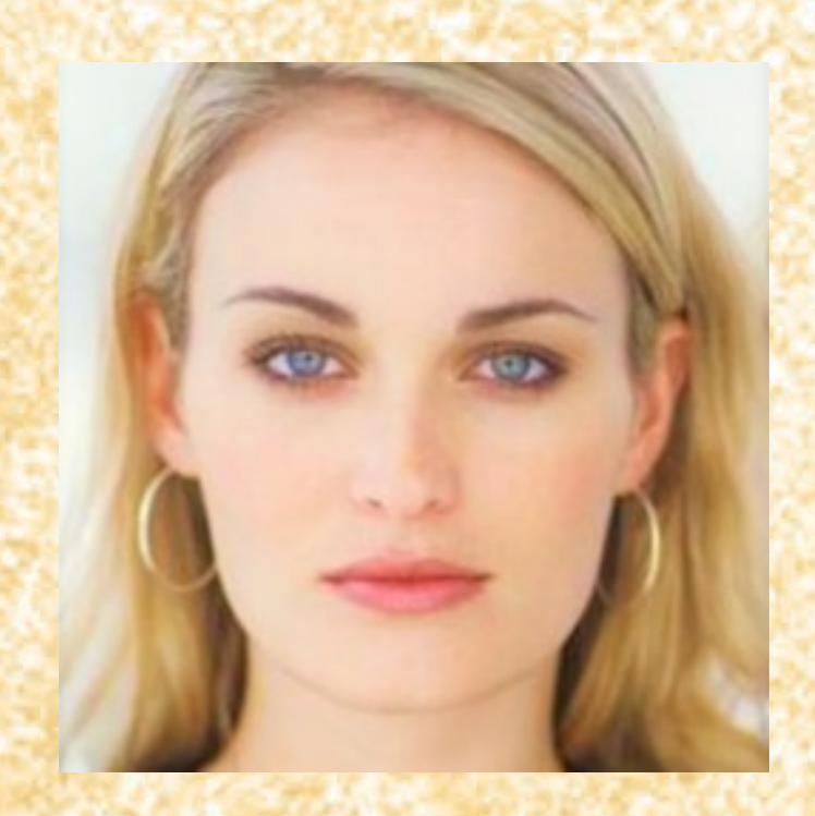
RIA ROMANO PUBLIC RELATIONS